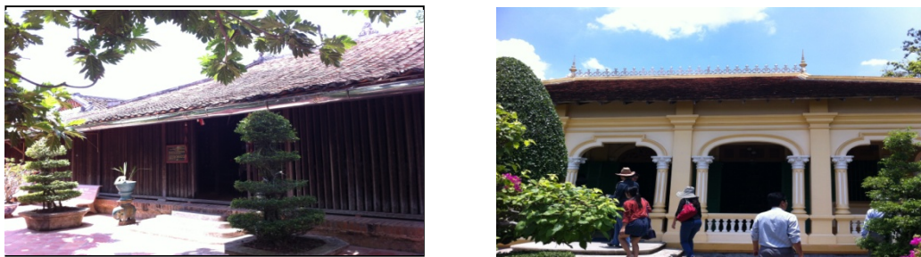
Figure 2. Tran Tuan Kiet house and Phan Van Tuan house were authentically restored by the JICA project

However, through in-depth interviews and on site observation, it has been found that some other owners use cement or concrete to repair damaged parts which will diminish the authenticity of heritage values in ancient houses. While there are approximately ten ancient at Dong Hoa Hiep village, JICA had a limited budget to repair damaged houses. Therefore, JICA only choose those with significant and unique architectures to restore. Most ancient houses were passed from generation to generation and these houses were built by ancestors more than 100 years ago. The degradation of residences is inevitably and some local people want to change to new modern styles because of the aging of their residences. As mentioned previously, due to high price of original wood and hiring craftsmen, owners use cement or concrete to repair damaged parts. On the other hand, cement and concrete do not become infested by insects who can destroy wooden materials. Dong Hoa Hiep is noted as one of three ancient villages in Vietnam, so these Southern styled, ancient, wooden houses have architectural features that are unique, cultural values for this village. If local authorities don’t have regulations for ancient house repair and supports, not only will these houses diminish in authentic value but the village’s image will be tarnished in the long term because of using the wrong repair processes. Therefore, it is necessary to preserve the ancient image for Dong Hoa Hiep village.