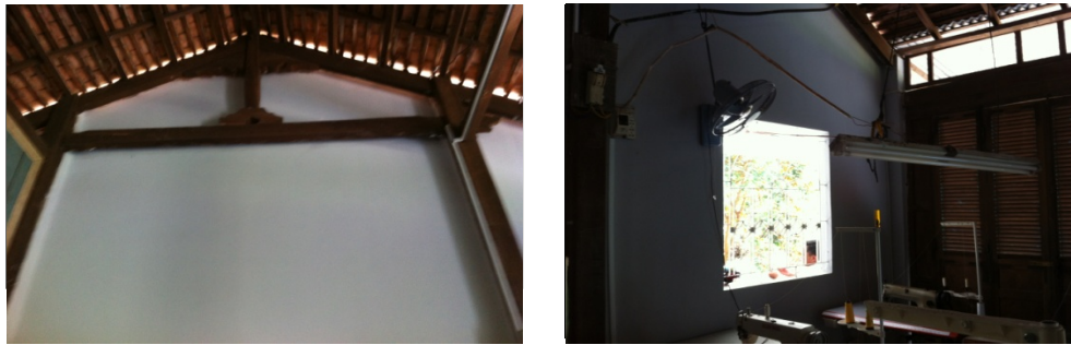
Figure 3. Damaged wall part at living local house was replaced by cement

In brief, according to local authority's perspectives and local resident's opinions, tourism creates both positive and negative cultural impacts on the local community, but the positive trade-offs outweigh its costs. From the local government's answers, it is concluded that tourism helps local communities to revive and preserve local cultural values. Tourism promotes cultural exchanges among local people and local people feel proud of their identities which are passed down from their ancestors. One concern mentioned above is the use of inappropriate materials to repair ancient houses not involved in the tourist trade and how this affects the authenticity of the village. Meanwhile, local authorities have a limited budget which cannot afford to support restoration for all ancient houses in the village. Another drawback to tourism is that the Milk Cracker crafts are vulnerable and could be forgotten. Especially in An Hiep, the Milk Crackers making household numbers has been gradually decreasing from 150 households to currently only 40 households. In fact, older people still keep their own traditional handicrafts as the way of earning and maintaining cultural values. However, the high price of raw materials, and lack consumption outlets people earn low profits for their very hard work from midnight to late afternoon. That is a reason why some residents have given up this craft at the present time.